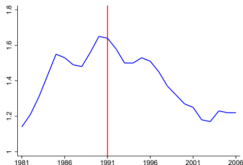
Figure 1: The relative price of investment in India from 1981 to 2006

The behavior of the relative price of investment in India stands in fascinating contrast to its well known fall in the US in recent decades (Greenwood, Hercowitz and Krusell, 1997). 1 As seen in Figure 1, relative to the Penn World Table benchmark index (Feenstra, Inklaar and Timmer, 2015), the relative price of investment in India rose 44 percent from 1981 to 1991 and subsequently fell 26 percent from 1991 to 2006. To contextualize the magnitude of this change in relative price, we can look at cross country differences in the relative price of investment in 1991. The average value of the relative price of investment for G7 nations in 1991 was 0.88 while the average for all other nations was 1.38 which is 57 percent higher. Similarly the one decade rise seen in India of 44 percent is equivalent to moving from the United States to nations such as Antigua and Barbuda or Estonia in terms of percent difference in the relative price of investment.