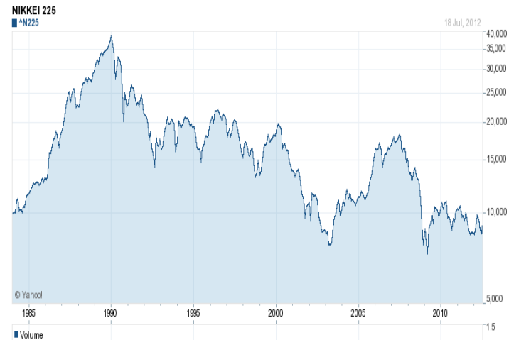
Nikkei since 1985 >>